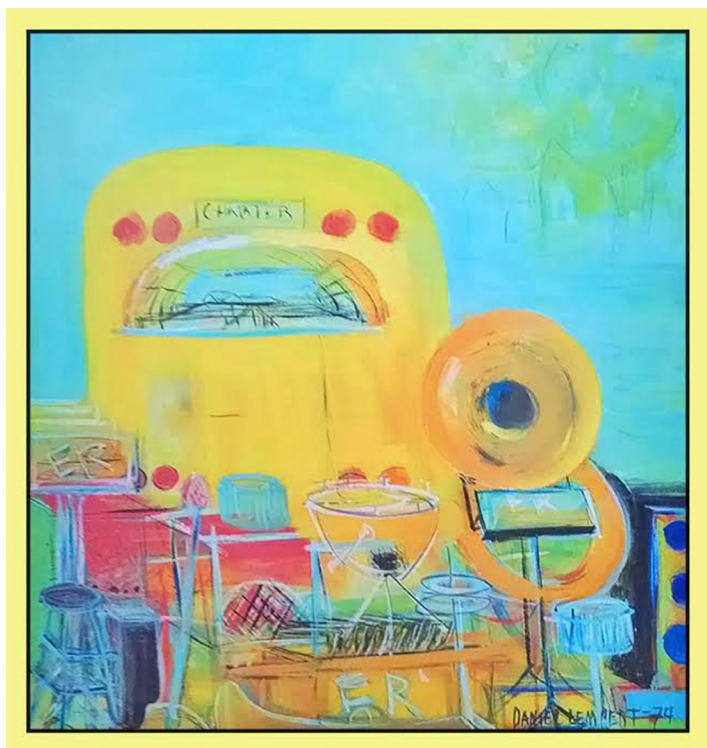
A color version of the painting is available at www.tinyurl.com/zup5eah .

Please visit the Alumni Foundation’s Website, at www.erschools.org/alumni.cfm !